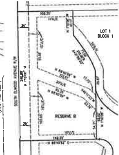
Detail A Reserve B Scale: 1" = 50'